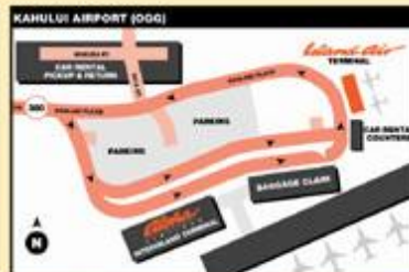
Above left: Map courtesy of the Maui Drive Guide . You'll find this, as well as more detailed driving maps for the entire island, in your complimentary copy of the Drive Guide , available at all car rental counters.